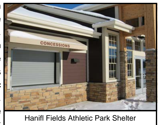
Hanifl Fields Athletic Park Shelter

The Parks Commission developed the Hanifl Fields Athletic Park on the property located at 7032 137th Street. The park includes five soccer fields and a new park shelter that was completed in 2010. The Hanifl Fields Athletic Park was the host of the Minnesota Youth Soccer Association tournament and East District Girls Soccer State Tournament. The tournaments brought approximately 2,000 visitors to Hugo over a weekend in July. The EDA recognizes the economic impact of park improvements and events that draw visitors to Hugo. The park shelter will also hold a concession stand that will provide food and drink during the future tournaments or events. The park shelter will be rented out for community or family events starting in Spring 2011. In addition, the Parks Commission has made improvements to Lions Park and Irish Avenue Park. There is a new skate park and improved tennis/pickle ball courts at Lions Park located adjacent to Hugo City Hall. The Irish Avenue Park, purchased in 2009, is located off of County Road 8 and Irish Avenue and is a restored gravel pit. There were two miles of trails mowed and a parking lot constructed for residents to use the passive park during the summer. In the winter the trails were groomed by the Hugo Snowmobile Club for cross country skiing and snowshoeing.